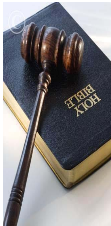
ur16780360 [RF]